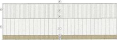
B2 SIDEWALL 1 ELEVATION