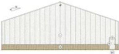
A2 ENDWALL 1 ELEVATION