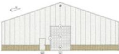
C2 ENDWALL 2 ELEVATION