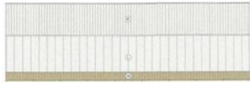
D2 SIDEWALL 2 ELEVATION